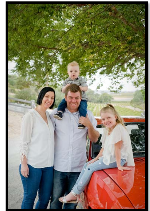
Natural & Affordable